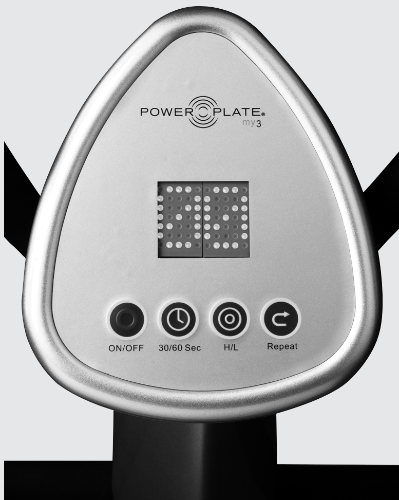
my3™ face plate